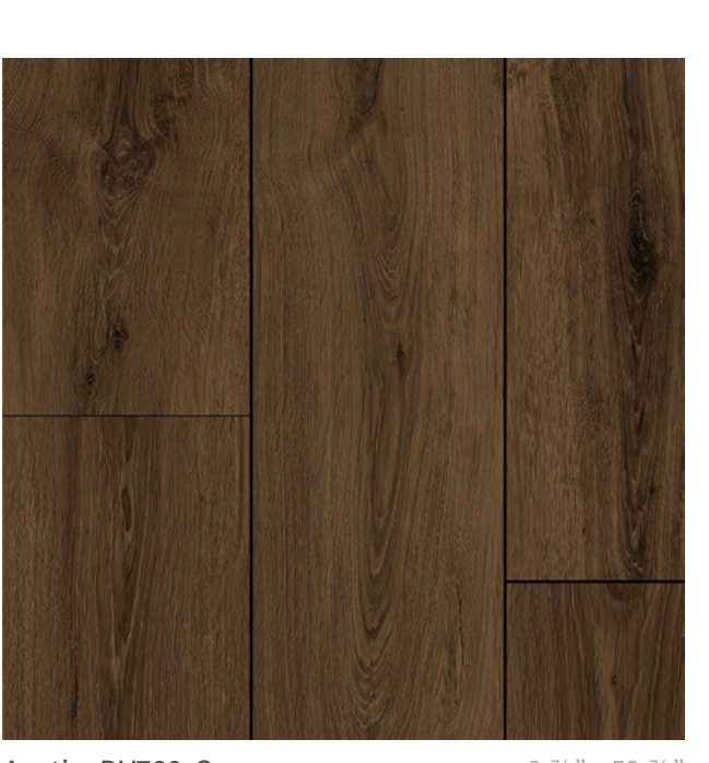
Austin DV789-C 8-7/8" x 59-7/8"