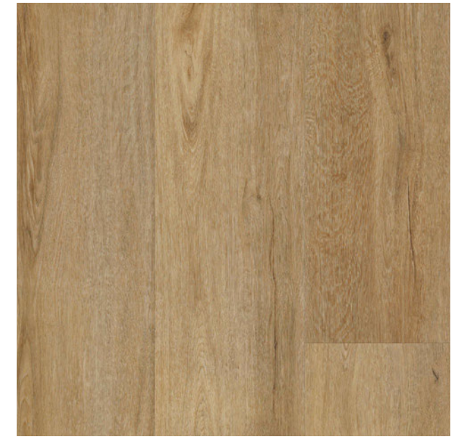
Whitney DV797-C 8-7/8" x 59-7/8"