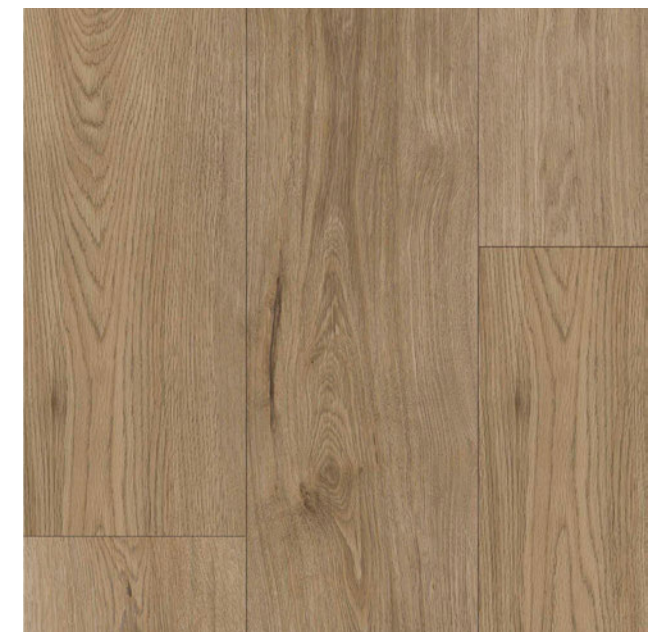
Conner DV788-C 8-7/8" x 59-7/8"