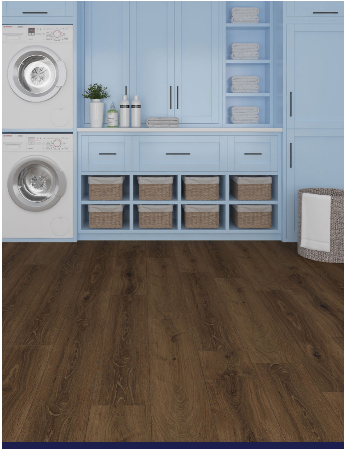
8-1/8" x 59-1/8" planks | 22.12 ft²/carton | embossed in-register