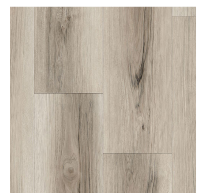
Bonita DV795-C 8-7/8" x 59-7/8"