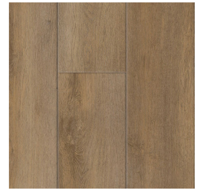
Crawford DV791-C 8-%" x 59-%"