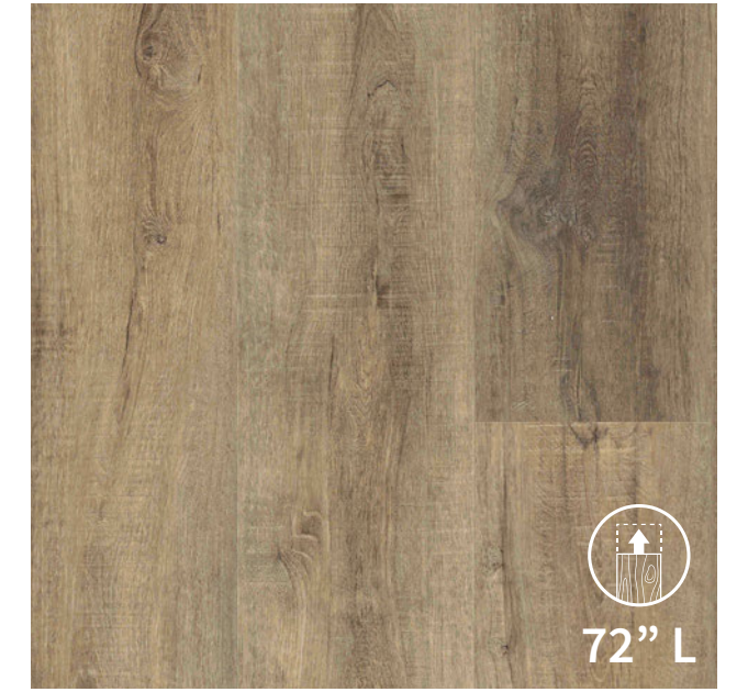
Echols DV799-C 8-7/8" x 72"