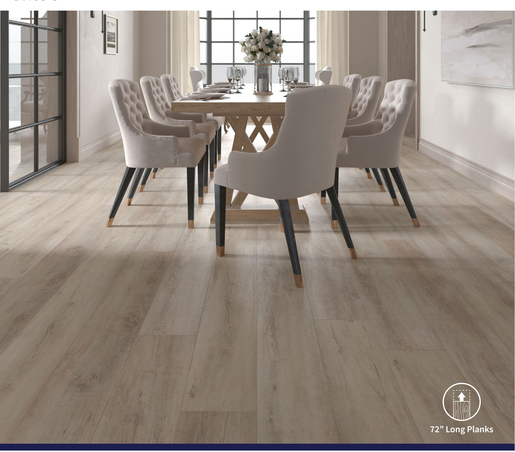
8-%" x 72" planks | 22.16 ft²/carton | embossed in-register