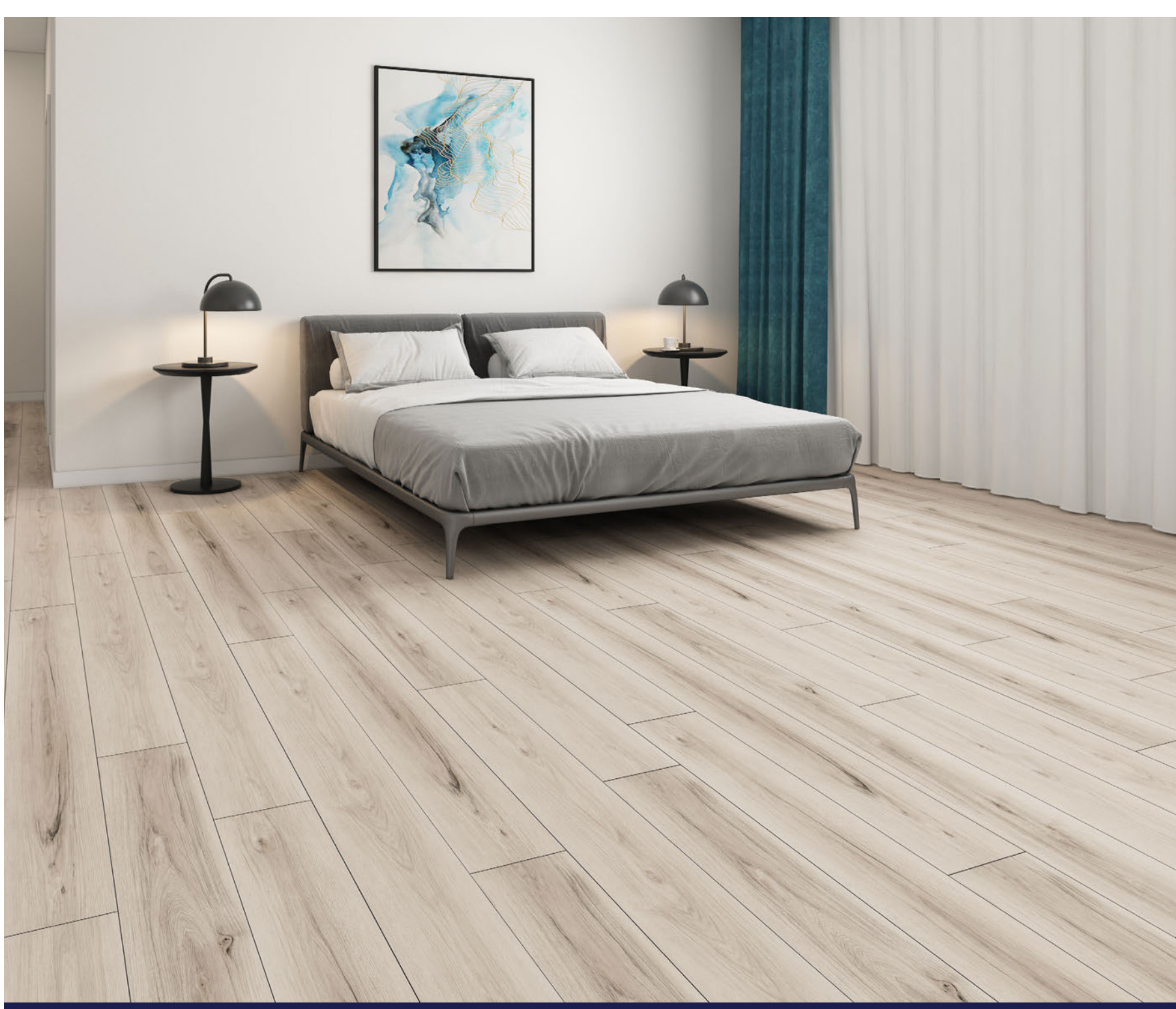
8-1/8" x 59-1/8" planks | 22.12 ft²/carton | embossed in-register