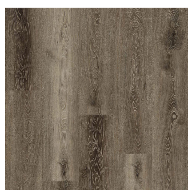
Avery DV786-C 9-3%" x 59-7%"