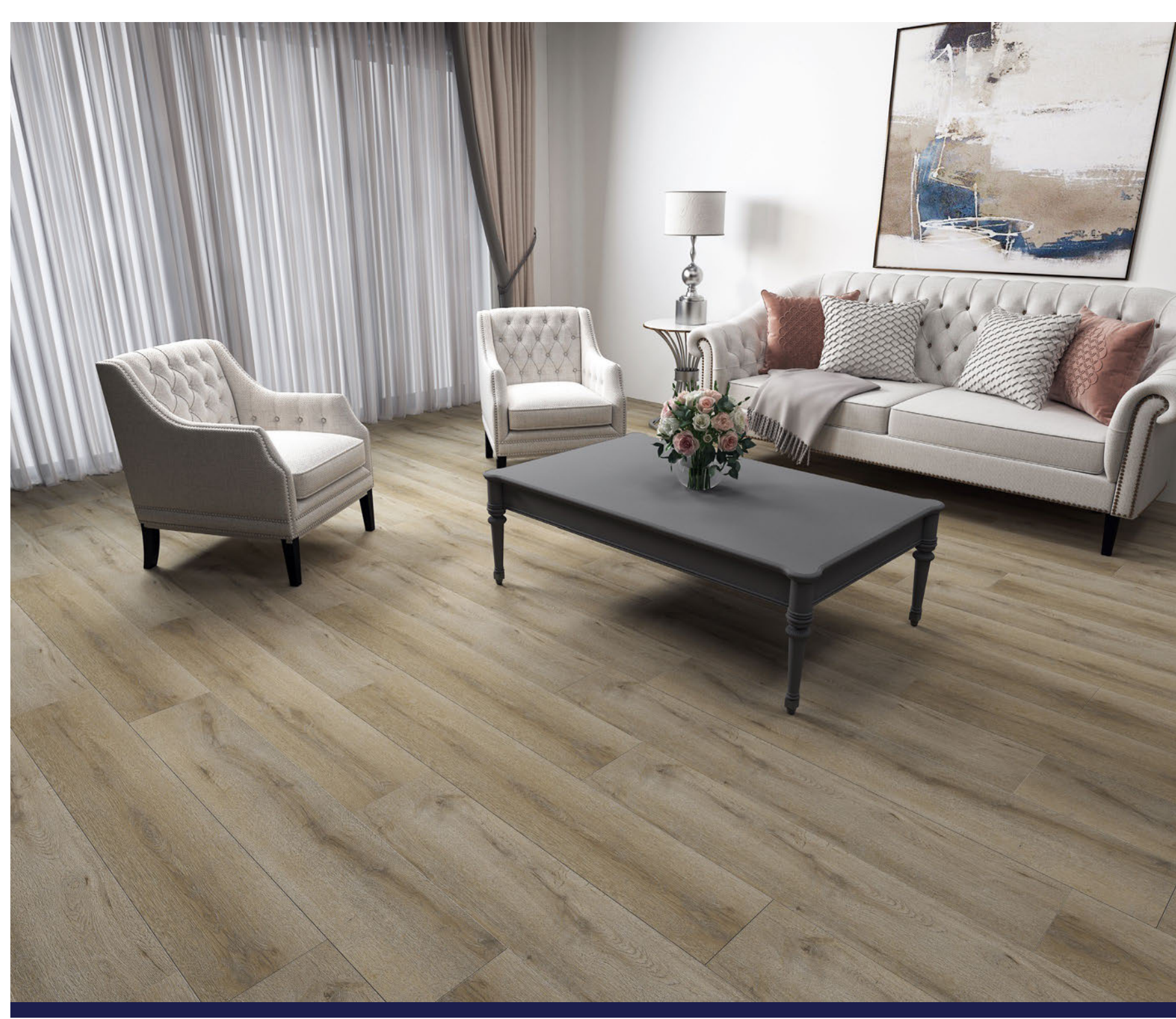
9-3%" x 59-7%" planks | 22.39 ft²/carton | embossed in-register