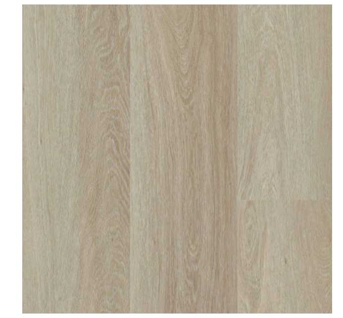
Evans DV787-C 8-1/8" x 59-1/8"