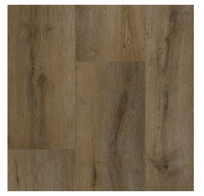
Buckley DV790-C 8-7/8" x 59-7/8"